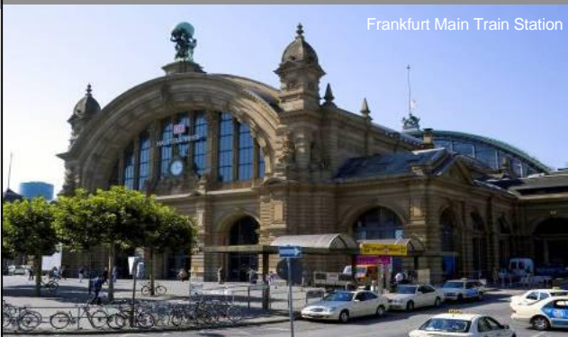
Frankfurt Main Train Station