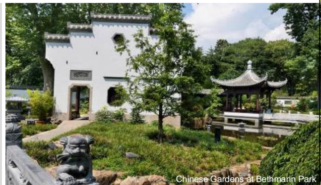
Chinese Gardens at Bethmann Park