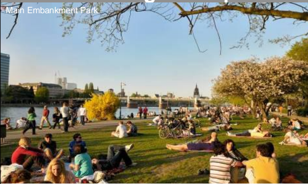
Main Embankment Park

A cosmopolitan city with a relaxing atmosphere