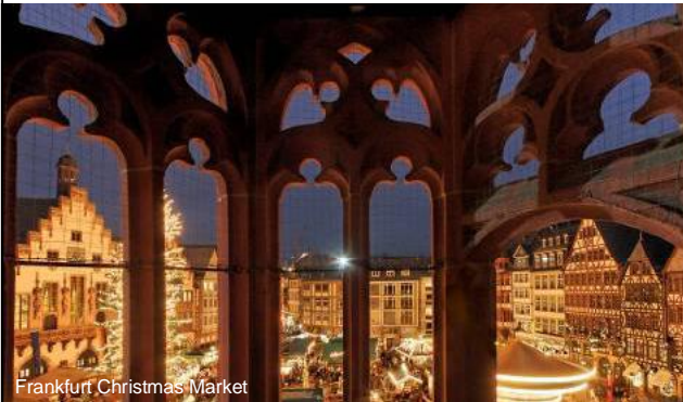
Frankfurt Christmas Market