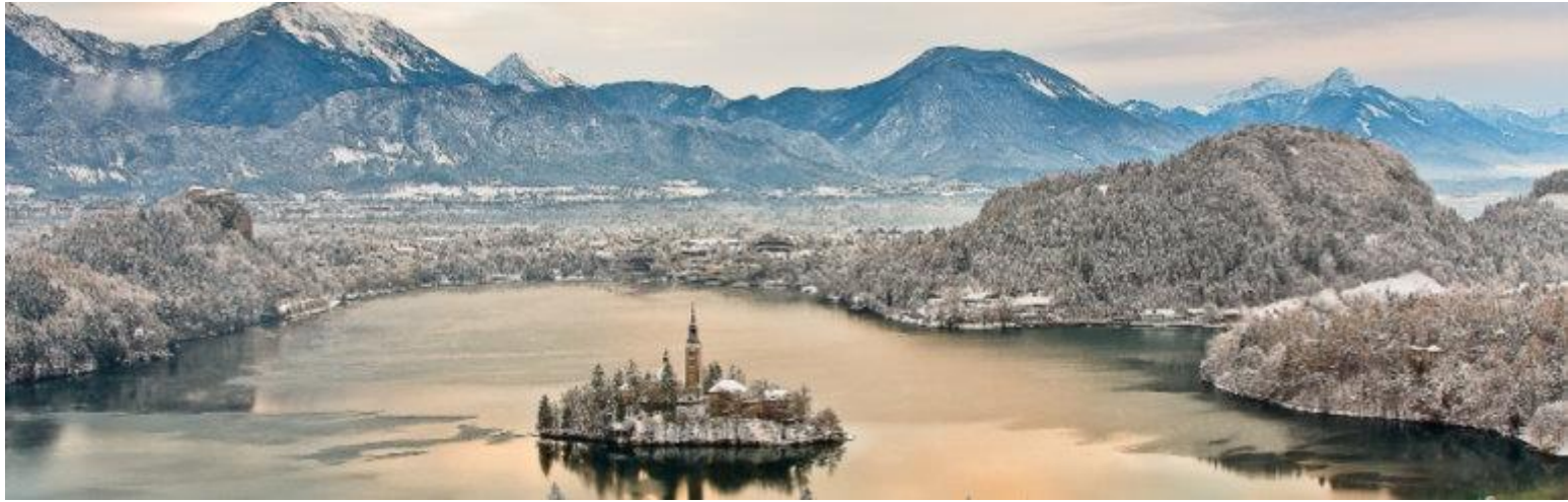
Winter wonderland at Bled