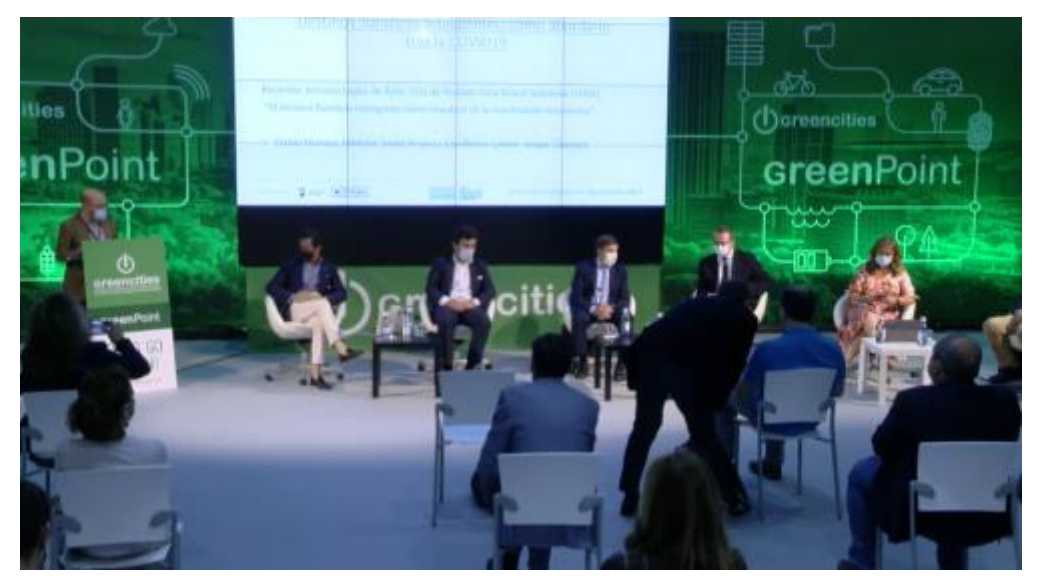
GreenCities event, Málaga, 1 October 2020