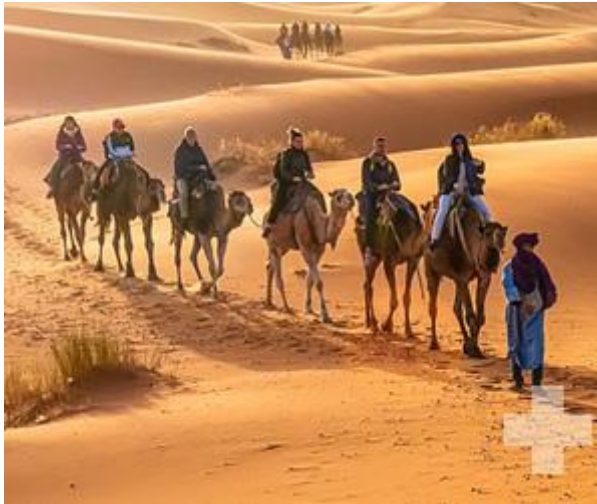
On the Ground - June 2020