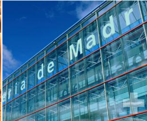
Fitur 2021 Highlights