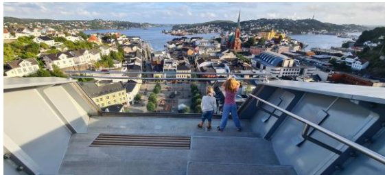
View from glass lift, photo: Marianne C. F. Ljøstad

OVER in Lillesand - the world's tallest free-standing climbing tower opened in June 2021. 47 meters high it is primarily an experience tower with internal stairs that is open to everyone. With sports facilities for climbing outside.