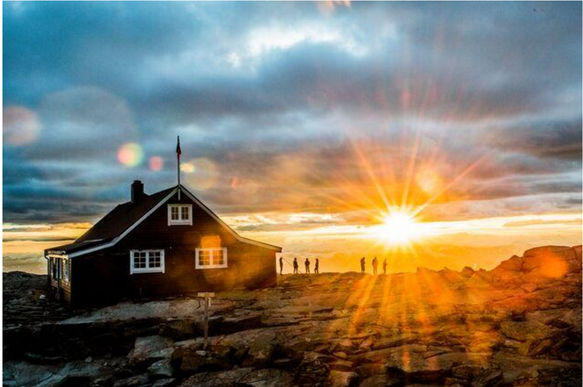
Fannaråken, photo: Thomas Rasmus Skaug - VisitNorway.com