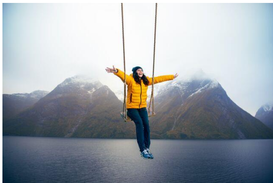
Hjørundfjord swing photoToke Mathias Riskjær - Visit Norway

Incredible, huge, and breathtaking – these descriptions apply to the fjords of Norway. In autumn, they even get mystical, and everything slows down here. The right time to take a break, expose yourself to energetic activities, cultural encounters and with incredible local food delicacies.