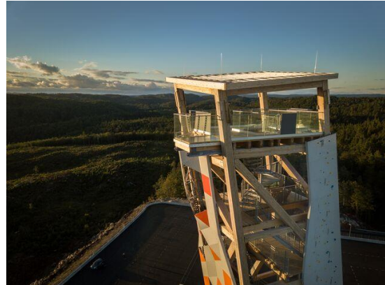
OVER, photo Tore Næss - Visit Sørlandet

A wonderful “shelter” against the forces of nature, the historical hotel Finse 1222 has been renamed and renovated . The old reception is now the “heart room” and opens to the train platform. Remember, there are no roads here.