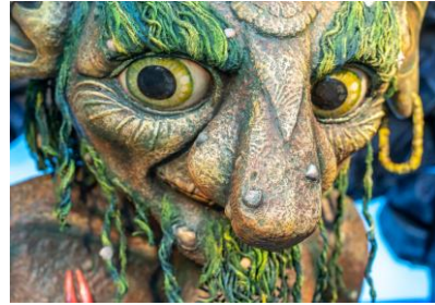
Sea troll face, photo: Troll Museum

A father and child dream comes true when the new restaurant “Slottet” opens in Sirdal on October 9th. Built on a vantage point and based on local traditions it offers special nature and food experiences. Slottet means Castle in English, just as the vantage point where the restaurant is located and where father and son began to dream about this, years ago.