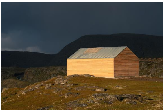
Havøysund, @Roni Horn

Norwegian trolls and nature come alive in the new troll museum in Tromsø , which opened this September. It is the first museum to offer Augmented Reality technology for visitors. Welcome to the world of trolls!