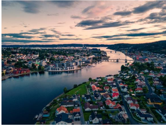
Porsgrunn

Congratulations to Skien and Porsgrunn in Telemark. The twin cities have been named Norway's most attractive cities in 2021. Attractive city is the state's award for sustainable urban and local development and is awarded by the Ministry of Local Government and Modernization.