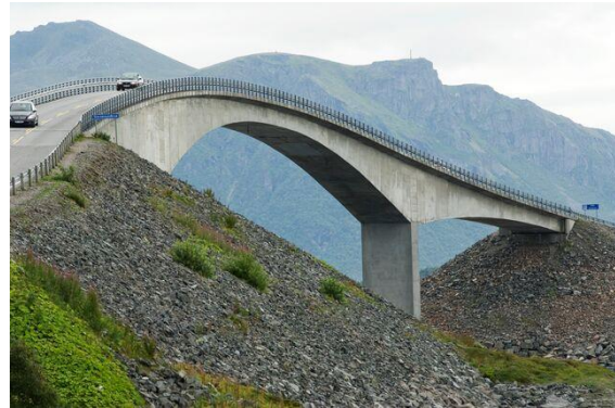
Atlantic road, Photo: CH - VisitNorway.com

The new James Bond blockbuster was partly produced in Norway. Norway is not only the coolest backdrop for James Bond in "No Time to Die", but it also allows you to follow in Bonds footsteps and even further – when experiencing stunning and cinematic scenery.