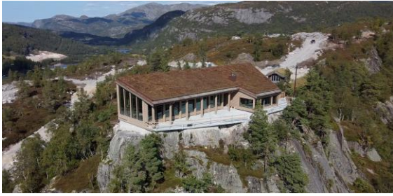
The Slottet restaurant in Sirdal, photo: @theslottet

A father and child dream comes true when the new restaurant “Slottet” opens in Sirdal on October 9th. Built on a vantage point and based on local traditions it offers special nature and food experiences. Slottet means Castle in English, just as the vantage point where the restaurant is located and where father and son began to dream about this, years ago.