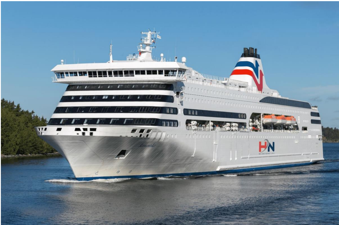
MS Romantika

In April 2022, Holland Norway Lines opens a new cruise ferry route between Southern Norway and the Netherlands . The route will be operated between Kristiansand and Eemshaven three times a week and takes 18 hours.