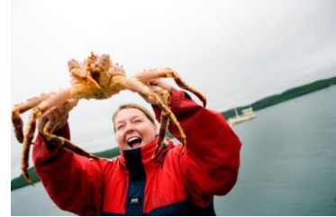
King Crab Safari in Kirkenes

They have been added to the list of Norway's sustainable destinations October.