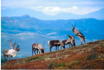
Reindeer in Norefjell mountains

Congratulations to the two new Sustainable Destinations