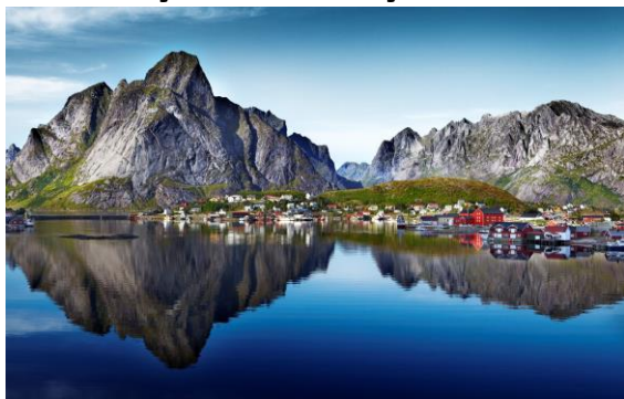
Lofoten Islands, photo: Matt Munro - Lonely Planet.jpg

Lonely Planet, the world-leading travel publisher, has chosen Norway to be one of ten countries worth a visit in 2022. Wow, what an honor! A recognition that Norway received due to the efforts for developing a sustainable tourism destination.