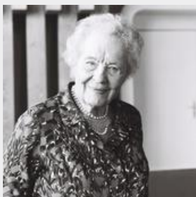
Louise Weiss A committed European

The exhibition “Louise Weiss: a committed European” tells the story of a woman who pioneered the European idea. Louise Weiss had an extraordinary life: as a campaigner, journalist, filmmaker, writer and Parliamentarian, she was a witness to several tumultuous changes in twentieth-century Europe. Discover the exhibition online or in Strasbourg. The temporary exhibition in the Louise Weiss building in Strasbourg can be found on level -1 of the visitor circuit.