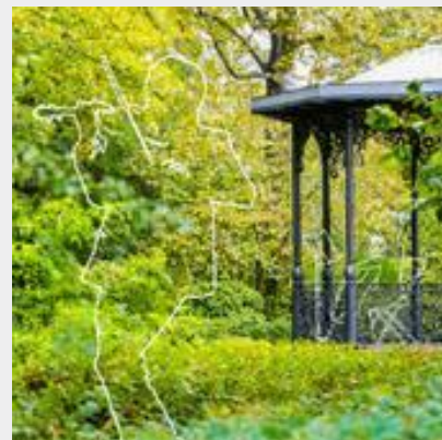
Citizens' Garden classical music concerts Weekdays, 13:00-13:30

This Thursday, museums in the European Quarter will come alive as part of the Brussels Museums Nocturnes. Start the cultural evening with a classical concert the