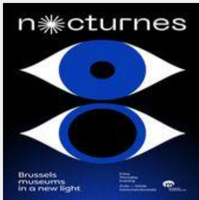
Nocturnes 19 May, 18:00-22:00

This Thursday, museums in the European Quarter will come alive as part of the Brussels Museums Nocturnes. Start the cultural evening with a classical concert the