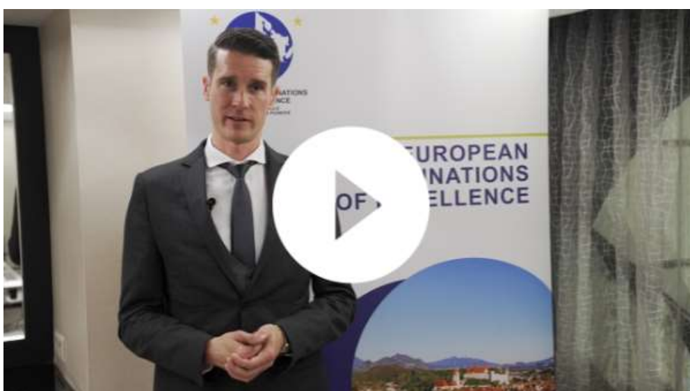
Representative from Kranj, Brussels, 9 November 2022

Since 2007, the European Commission has rewarded non-traditional, emerging sustainable tourism destinations in Europe through the “European Destination of Excellence” (EDEN) award. This year, 20 destinations competed, out of which 3 were shortlisted. Following the Jury meeting, Kranj (Slovenia) has been selected as the 2023 European Destination of Excellence for its pioneering work as a sustainable tourism destination. The Slovenian city will be promoted as a role model for sustainable tourism practices in Europe and benefit from event and promotional support throughout the year.