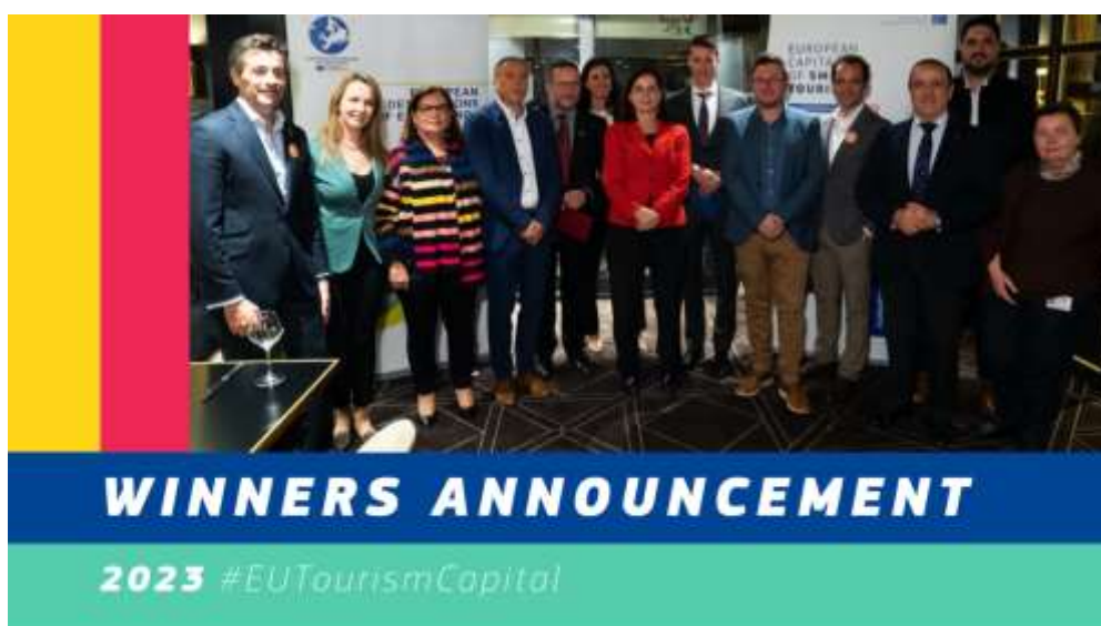
2023 European Capital of Smart Tourism winners' announcement, Brussels, 9 November 2022

Following a Jury meeting in Brussels on 9 November 2022, Pafos (Cyprus) and Seville (Spain) have been selected as the 2023 European Capitals of Smart Tourism . Both cities were nominated for their excellence as tourism destinations in accessibility, sustainability, digitalisation and cultural heritage and creativity.