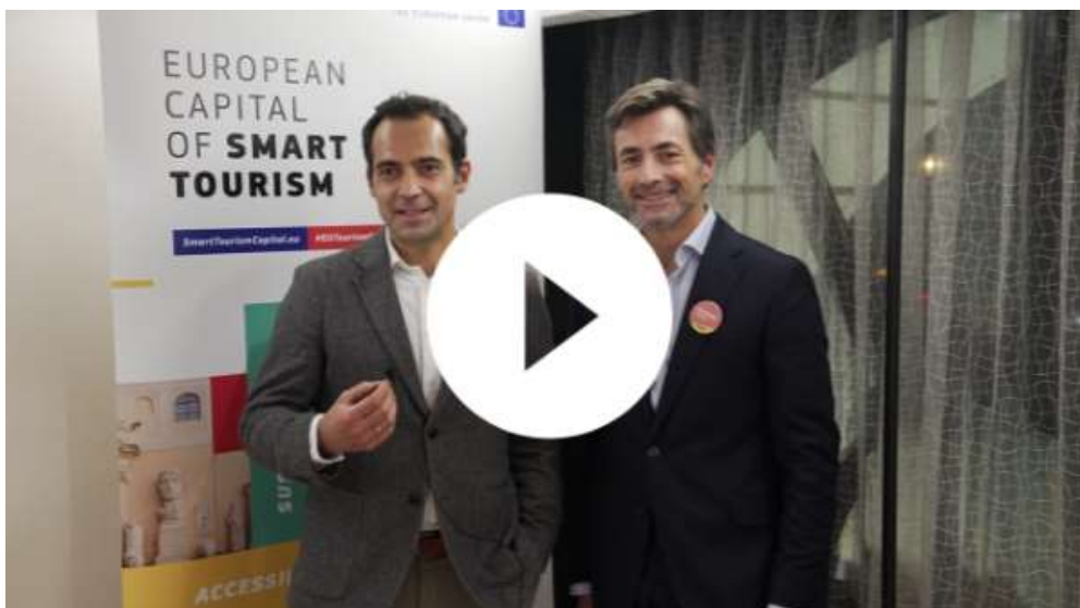
Representatives from Seville, Brussels, 9 November 2022

Click here to see the winner announcement and an interview with Seville .