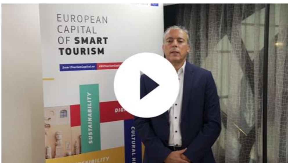
Representative from Pafos, Brussels, 9 November 2022

Pafos is internationally known as a tourist destination and has long been incorporating vital concepts of sustainability, innovation, and culture into its tourism planning. The city full of myths and legends is embracing all four categories of the initiative. Pafos stood out for the jury for its commitment to meeting ambitious sustainability goals, with constant monitoring and strategy review in place.