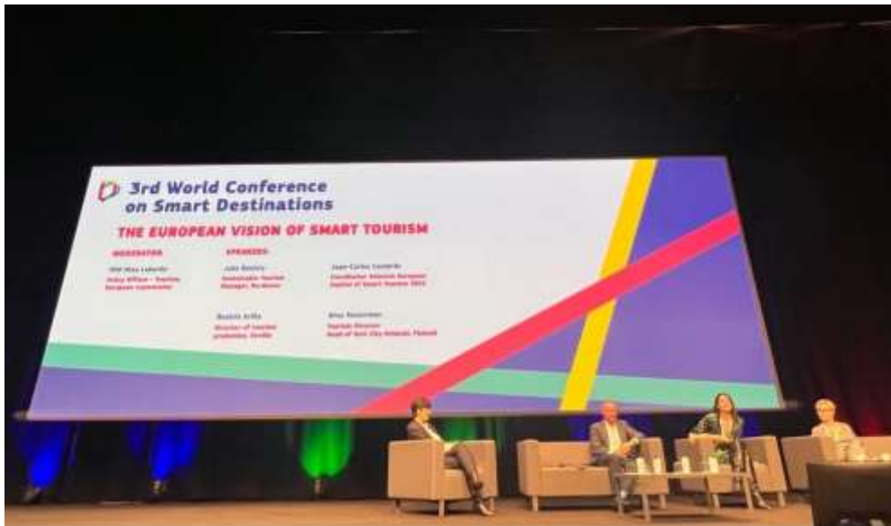
3rd World Conference on Smart Destinations, Valencia, 21-23 November 2022