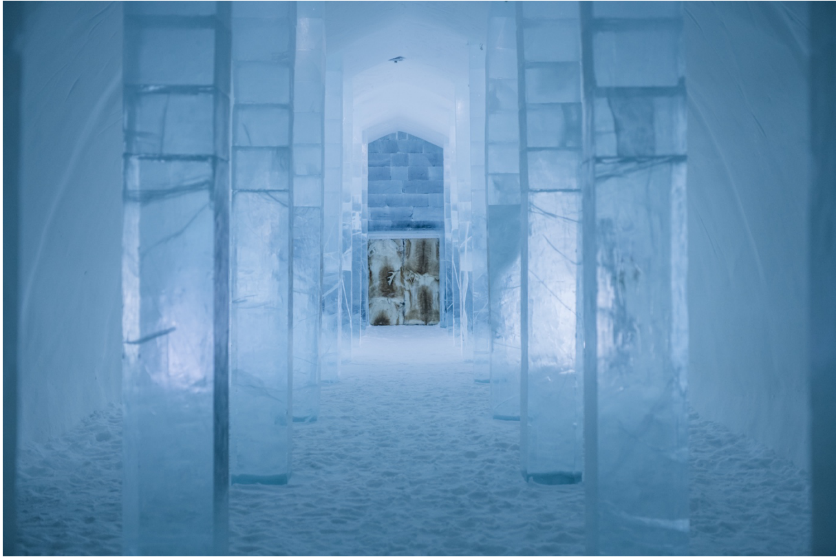
ICEHOTEL 34 Main Hall

On December 15th, the doors to this year's winter and art hotel in Jukkasjärvi, ICEHOTEL 34 were opened. The hotel, where every room is a work of art, makes the destination a unique art gallery. Its suites, sculptures, and halls are entirely made of ice and snow, all of which have been created by artists worldwide.